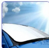
Solar Reflective Plate