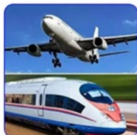
Aircraft, Automobile, Train