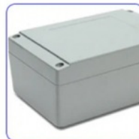
Electrical Products Shell