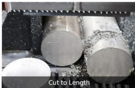
Cut to Length