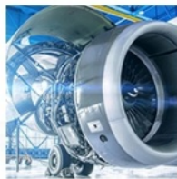
Aeronautics and astronautics