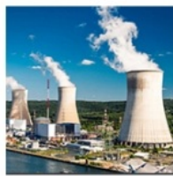
Electric power and nuclear power