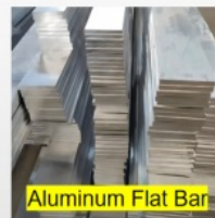
Aluminum Flat Bar