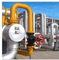
Petroleum and petrochemical

Aluminium flat bar can be widely applied in construction, machinery, electronics, sports equipment, advertising, transportation, consumer goods, furniture, aviation, military, and other applications.