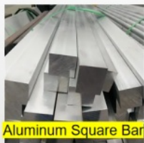
Aluminum Square Bar