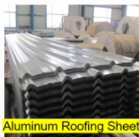
Aluminum Roofing Sheet