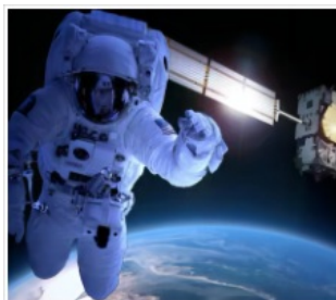
For aerospace parts