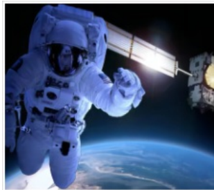
For aerospace parts