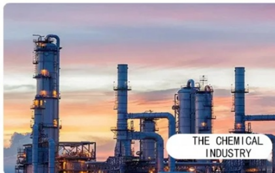
THE CHEMICAL INDUSTRY