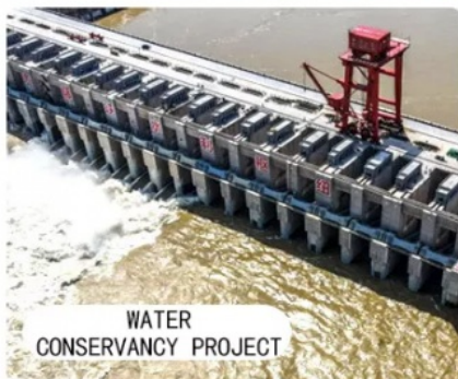
WATER CONSERVANCY PROJECT