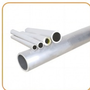
1. Aluminum tube/pipe