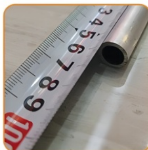
2. Length width test