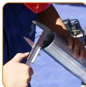
3. Edge measurement