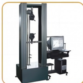
4. Tensile testing machine