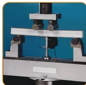
6. Bending test