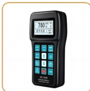
5. Hardness tester