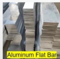
Aluminum Flat Bar