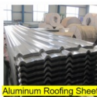
Aluminum Roofing Sheet