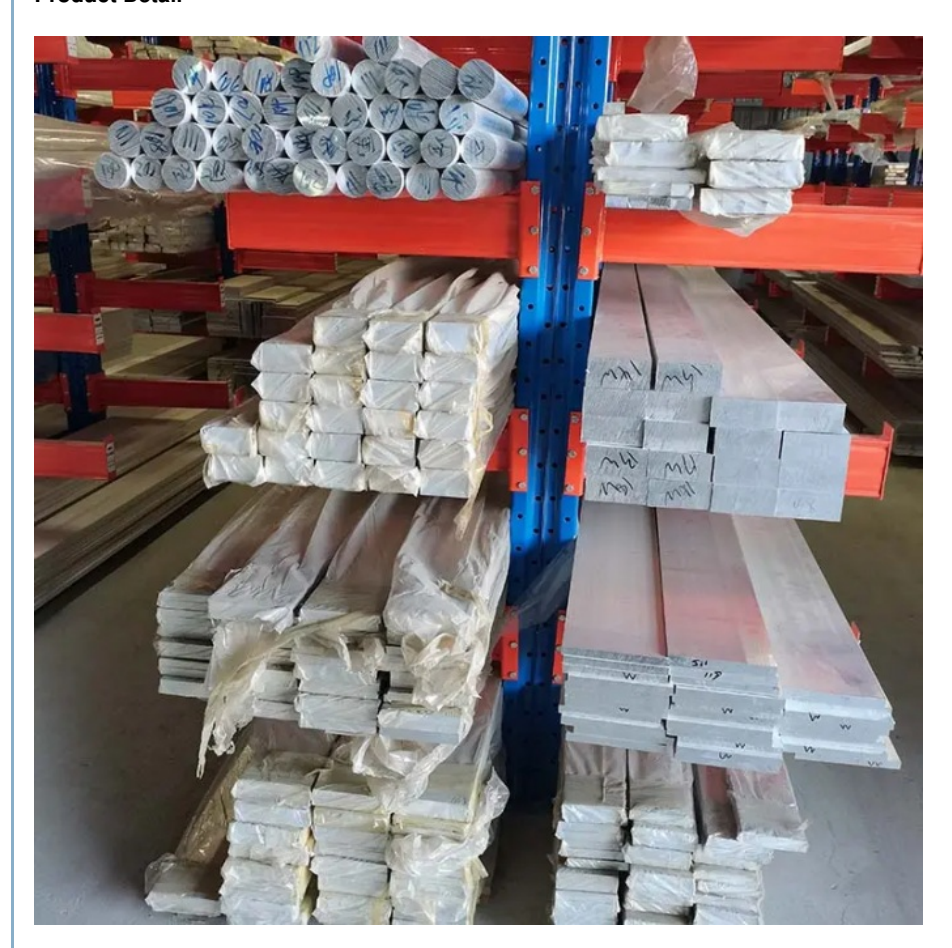
Packing and Shippment