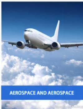
AEROSPACE AND AEROSPACE

Aluminium rods are suitable for various industries, such as aerospace, automotive, construction, decoration, electronics, marine, and many more. It is also widely used in industrial parts, transport equipment, shipbuilding, machinery, furniture, and other areas.