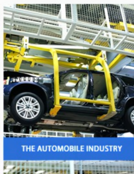
THE AUTOMOBILE INDUSTRY