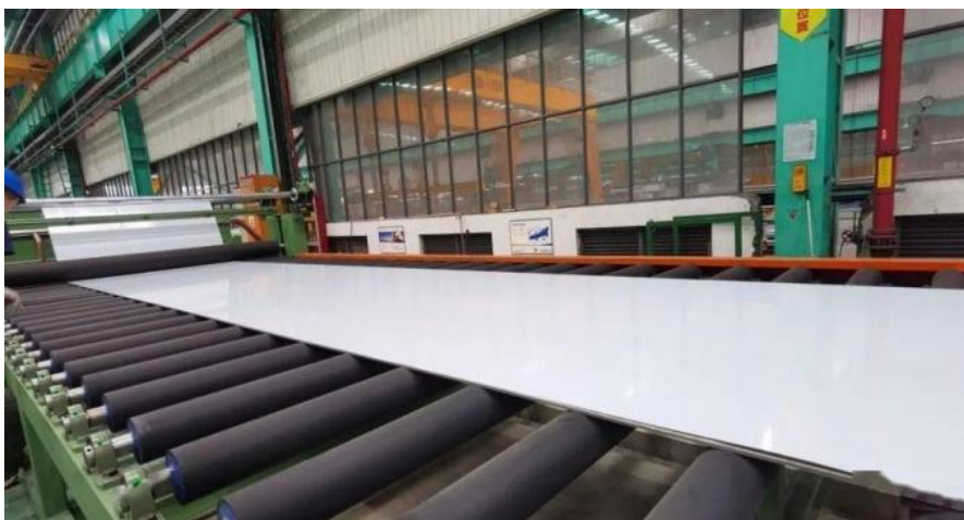
Packing & Shipping