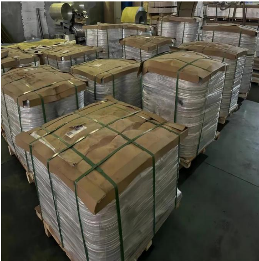
Packing and Shippment