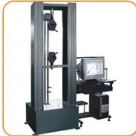
4. Tensile testing machine