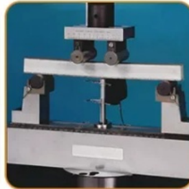
6. Bending test