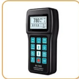
5. Hardness tester