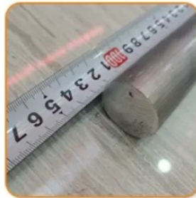
2. Length width test