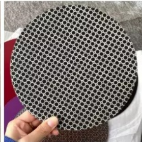
Aluminum Induction Disc