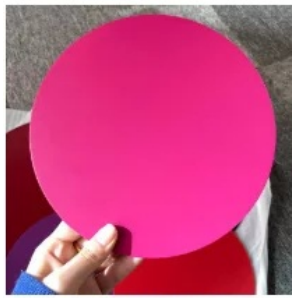
Pink Aluminum Circle