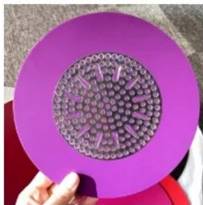
Aluminum Induction Disc