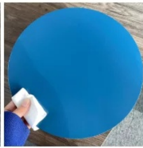
Blue Aluminum Circle