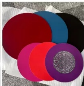
Aluminum Circle Disc