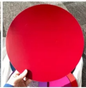
Red Aluminum Circle