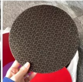
Aluminum Induction Disc