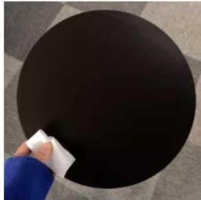
Black Aluminum Circle