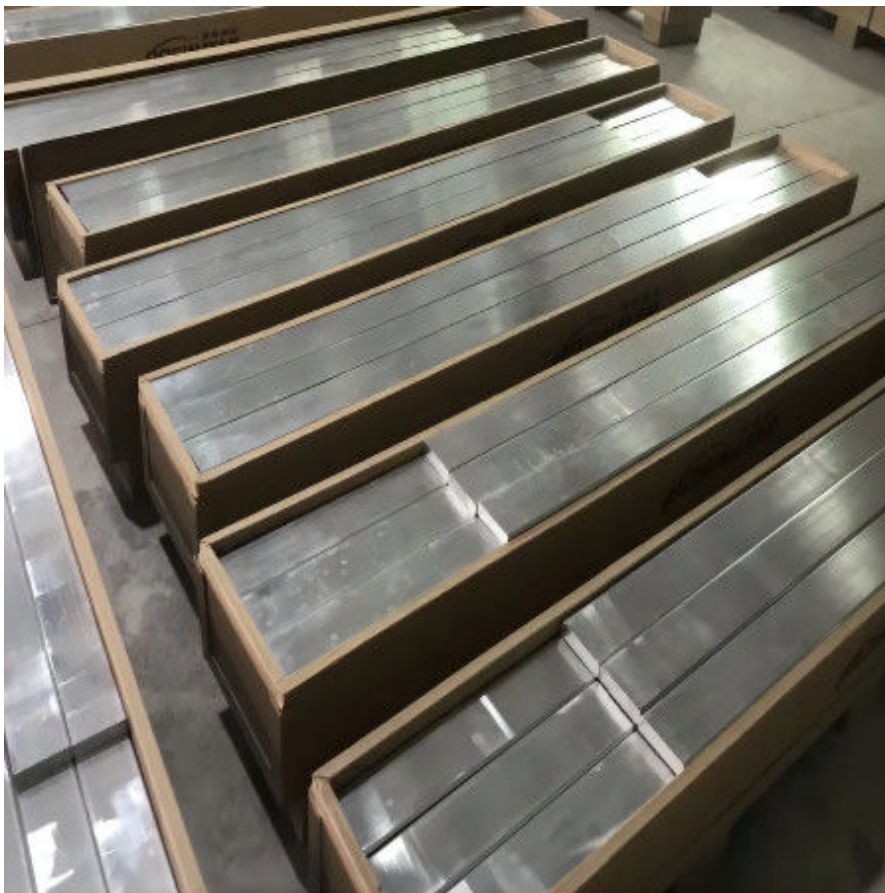
Packing and Shippment