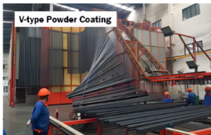
V-type Powder Coating