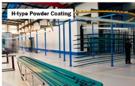
H-type Powder Coating