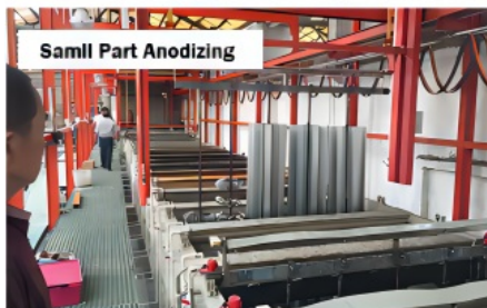
Small Part Anodizing