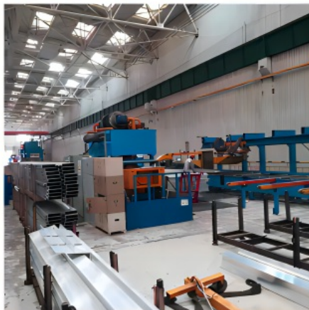
Surface Treatment Lines